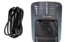
VP10 16.8V Battery Charger